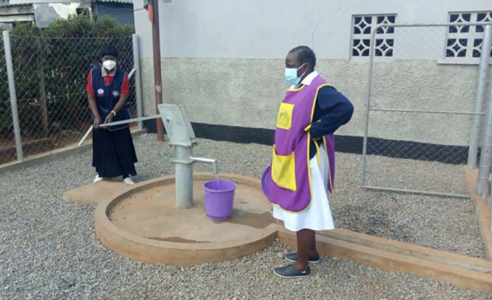
Before and after: This borehole at Mushili Health Centre was non-functional for four years before the SUNTA Project repaired it, restoring access to clean and safe water.