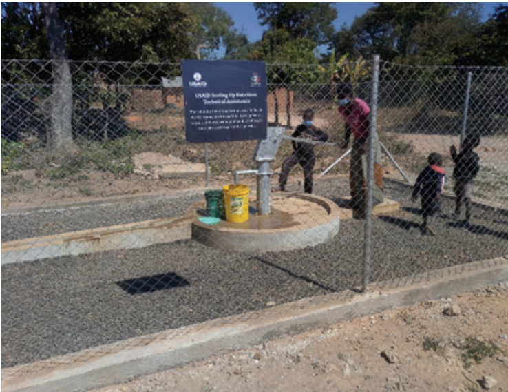
Before and after: This borehole in Kayoche village was non-functional and abandoned for two years before the SUN TA Project repaired it, restoring access to clean and safe water.