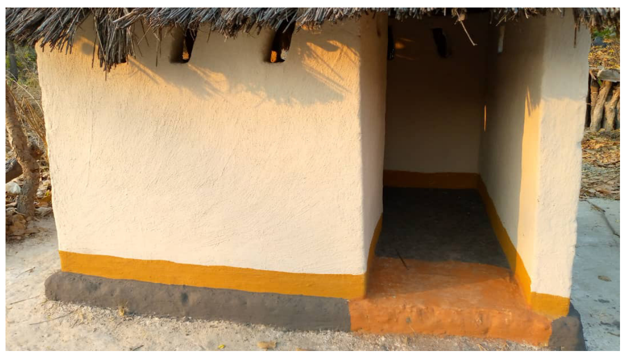
Construction of latrines increases hygiene and sanitation in communities