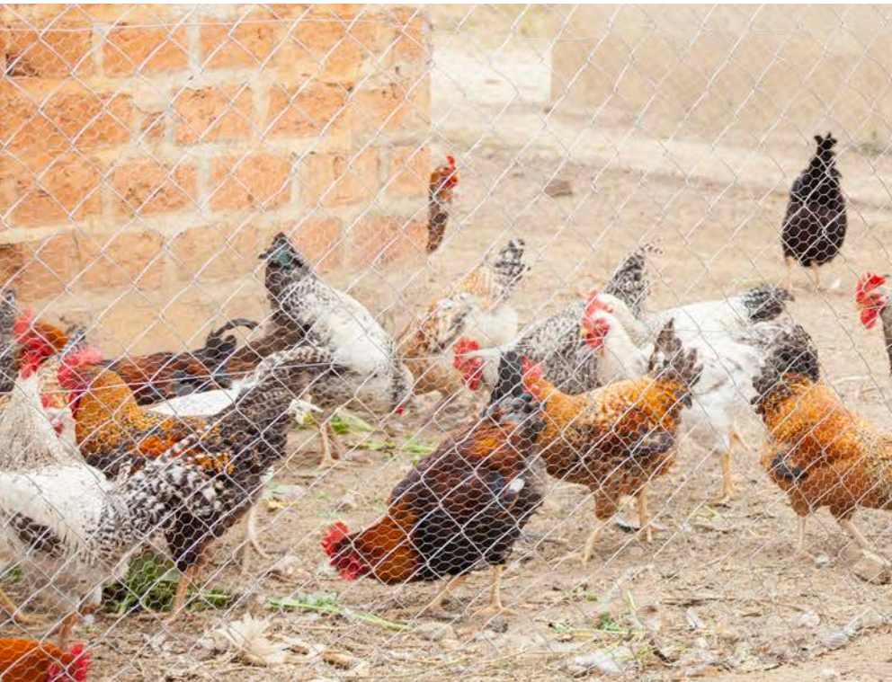
AGRICULTURE AND LIVELIHOODS