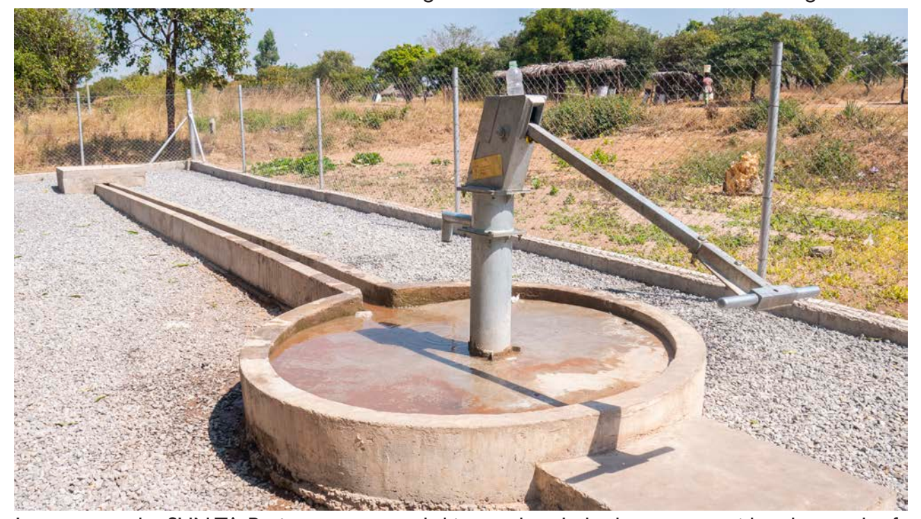
In response, the SUN TA Project constructed this new borehole that now provides clean and safe water to the people.