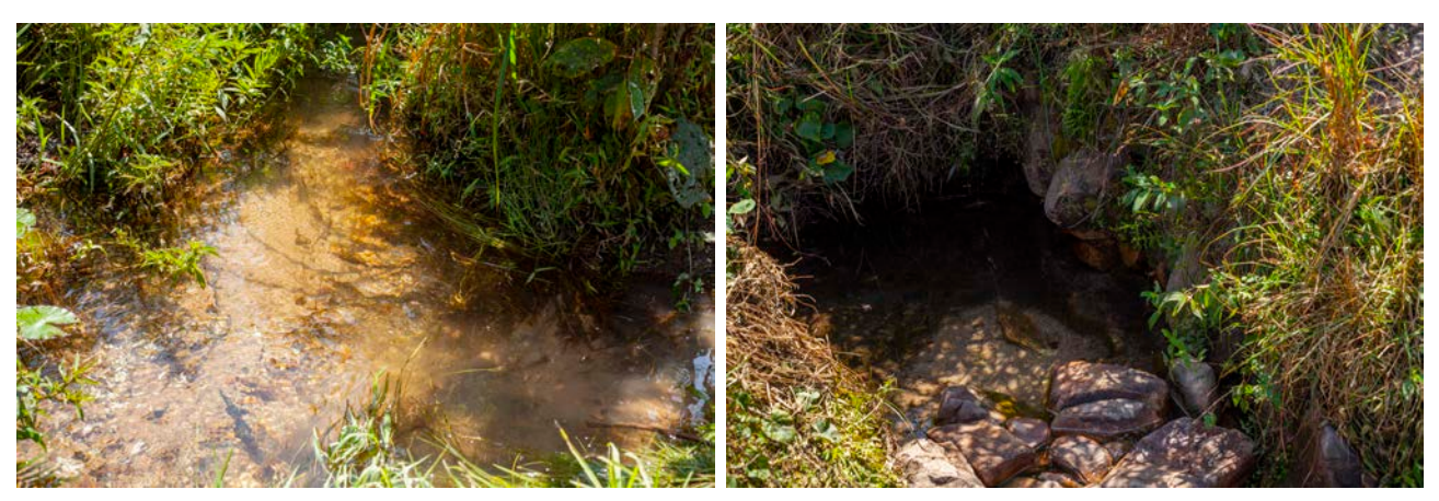
This is where some residents of Kalindila village in Mansa District accessed their drinking water.