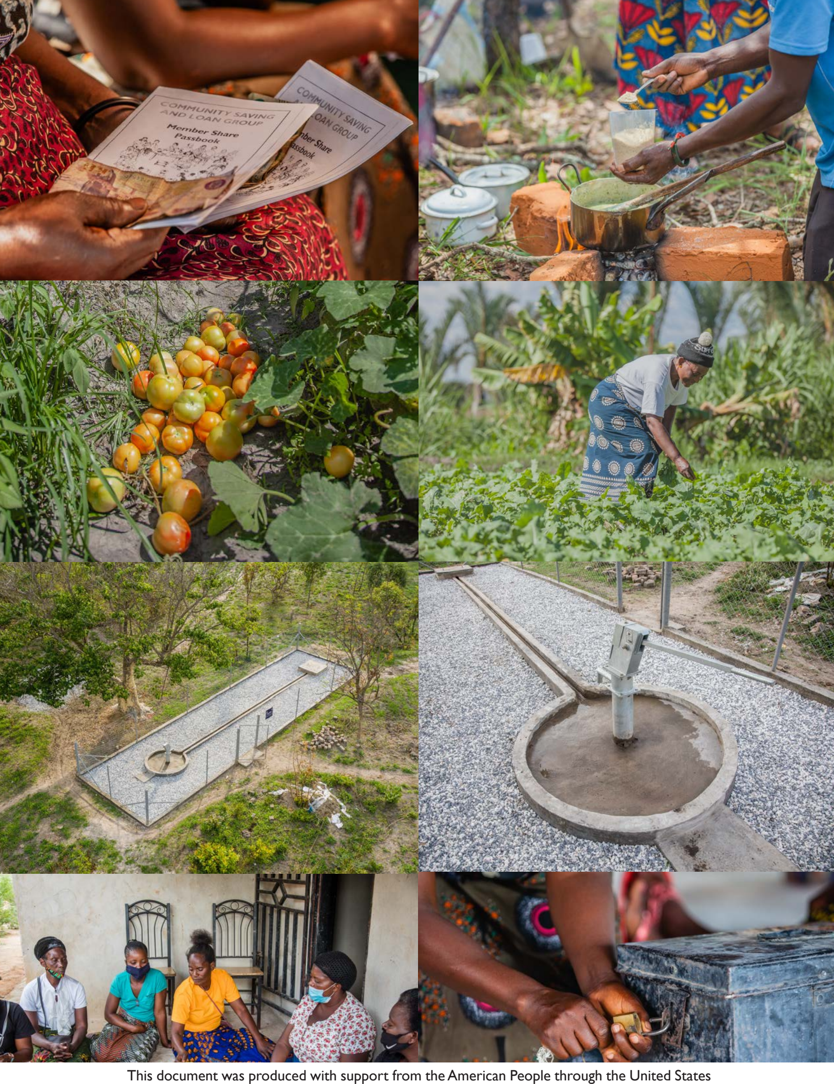
This document was produced with support from the American People through the United States Agency for International Development (USAID). However, the views expressed in this publication do not necessarily reflect the views of USAID or the United States Government.